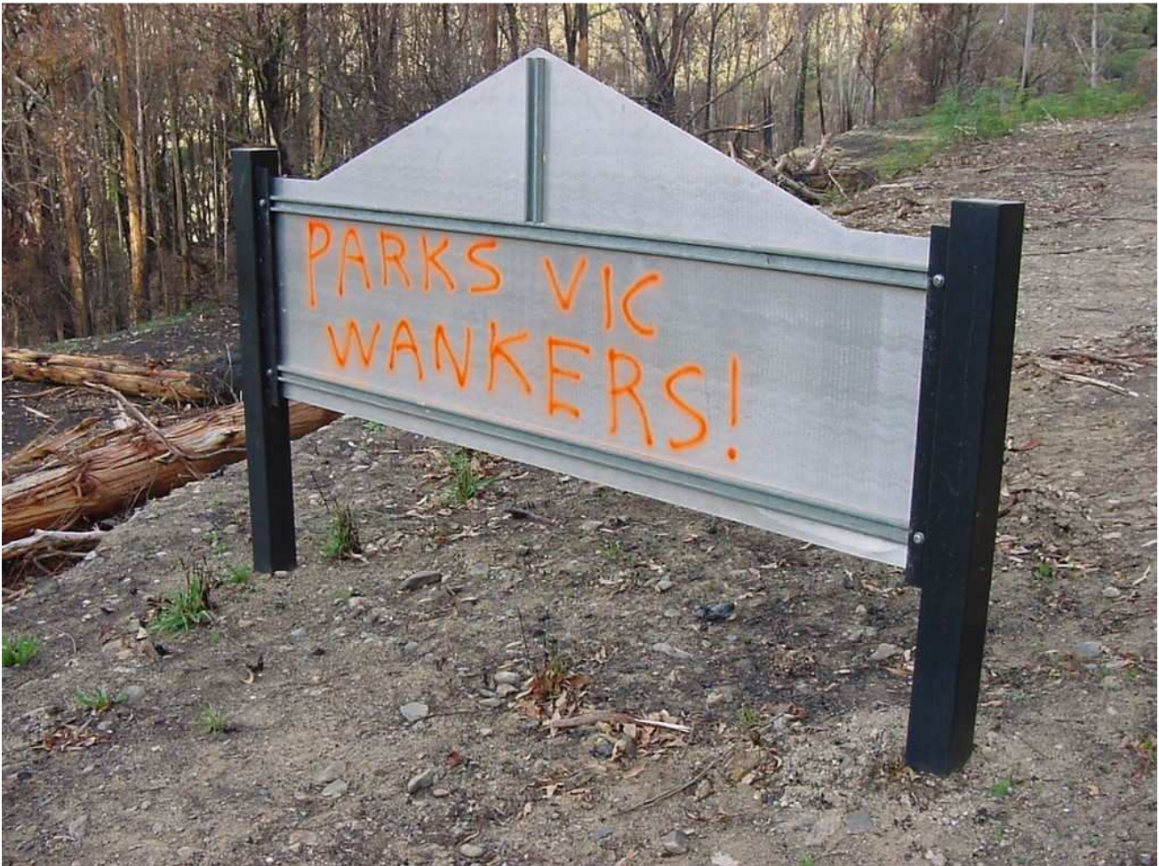
Pictured: Local residents express their views after the 2003 bushfire crisis – Falls Creek road at Bogong Village